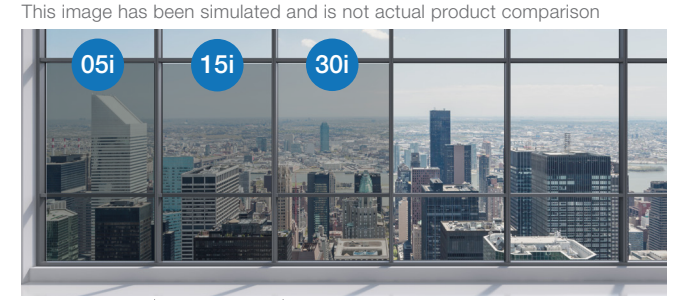
NT Natura 05i NT Natura 15i NT Natura 30i