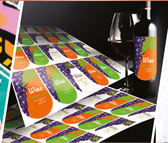
CONTOUR CUT LABELS