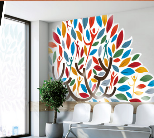
WINDOW AND WALL GRAPHICS