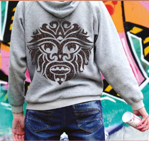
HEAT TRANSFER APPAREL