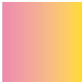
13141 SOLAR ASLSE7013141