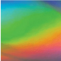
13150S HOLOGRAPHIC ASLSE72131501010

Aslan Holographic SE 72 is a silver self-adhesive film that shimmers in all colours of the rainbow. The PVC-free 50m PET film can be printed with Latex and UV curable inks as well as with screen-printing inks. Whether it's used as an eye-catching background, logo, sales display or for interior design - with the self-adhesive holographic film you will have all attention on your advertising message. It can be used for short-lived campaigns as well as for long-lasting outdoor and indoor projects.