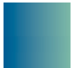
13145 PLASMA ASLSE7113145